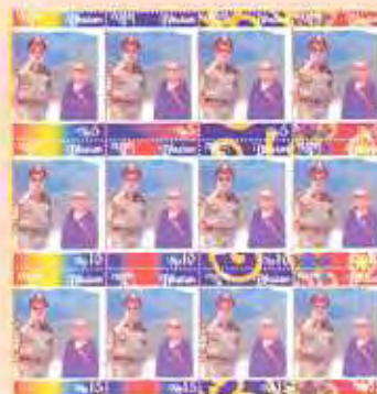
The Bhutan Govt acknowledged the presence of our General and Ma'am by issuing 3 commemorative stamps of Ngultrum 5, Ngultrum 10 and Ngultrum 15. The Ngultrum is pegged to the India rupee.