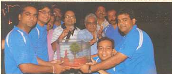
It was a thrilling event.