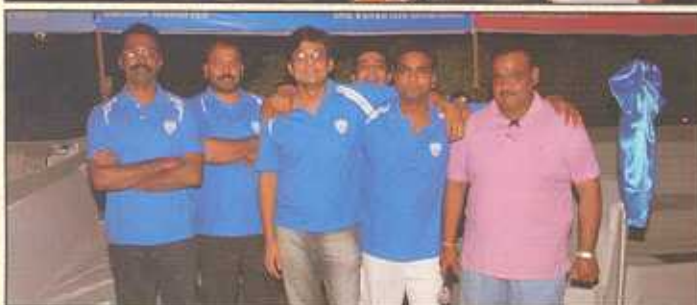
The Spice Cup was lifted by Gwalior Maharaja. (Photo below)