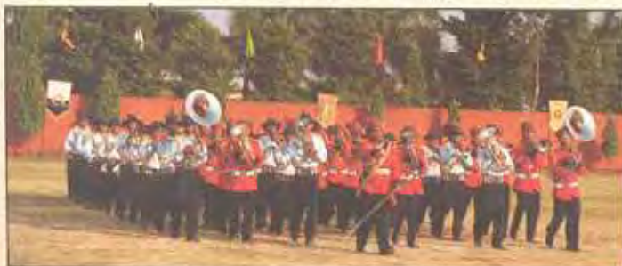
Astachal • Mar